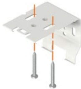
Ceiling / Inside Mount

Securely affix the mounting brackets on the ceiling or wall where you are installing the shade. Ensure that two brackets are positioned at least two inches from the ends of the shade, if required additional brackets can be installed evenly spaced across the width of the shade.