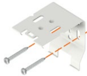
Wall / Outside Mount